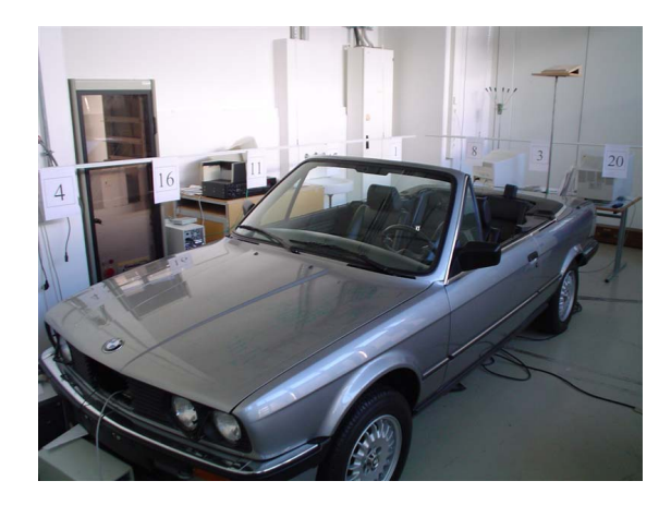
Figure 3. Driving simulator, surrounded by numbered sheets at eye level

during the simulation. Simulated traffic scenes are shown on a planar screen at a focal distance of 3 meters in front of the car driver. The HUD-based visualizations are shown by a second appropriately calibrated projector on the same screen <sup>1</sup>. The simulation covers a 50-degree visual field of view.